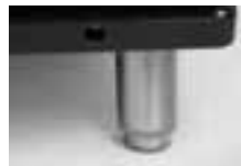
Adjustable legs (from 101-152mm) available with optional leg kit K-00345.