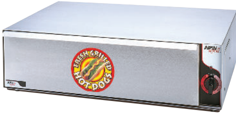
Model BW50 (shown)

APW Wyott bun warmers provide gentle warmth for hot dog buns, keeping them an ideal temperature and texture. A slide-out drawer makes access easy for customers and clerks. Infinite controls are easy to use and set the optimal temperature.