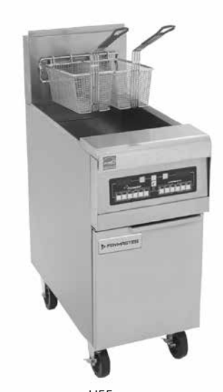
H55 Shown with optional casters